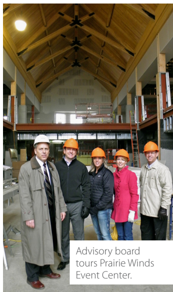
Advisory board tours Prairie Winds Event Center.

Advisory Board on November 7. More than 50 names were submitted in response to the naming contest, and each were reviewed by the board. The Council endorsed the advisory board's