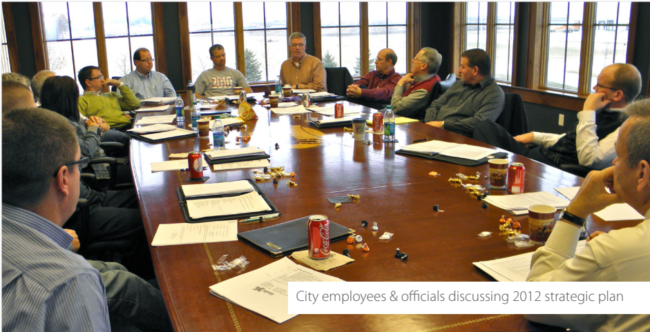
City employees & officials discussing 2012 strategic plan