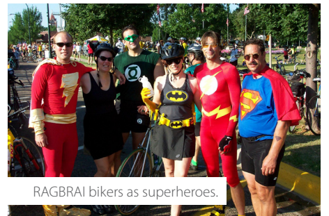
RAGBRAI bikers as superheroes.

The Des Moines Register recently announced the route for the 40th Annual RAGBRAI bicycle ride across Iowa. On the first day, Sunday, July 22, riders will travel from Sioux Center to Cherokee. Orange City was a natural stop to serve as a "pass-through" community to provide in-route accommodations.