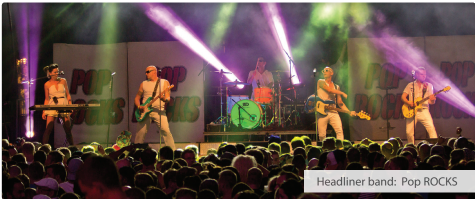
Headliner band: Pop ROCKS

for the most current information orangecityiowa.com