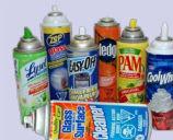
Aerosol spray cans (must be empty)