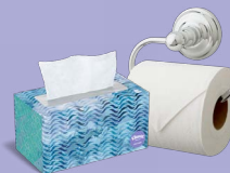
Kleenex, tissues & toilet paper