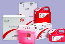
Medical supplies & sharps