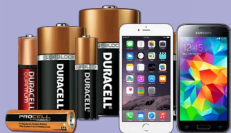
Alkaline batteries & cell phones (fire hazard)