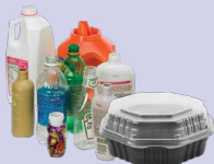
Plastic food containers & lids