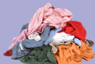
Clothing, textiles, & shoes