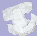
Diapers & pet waste