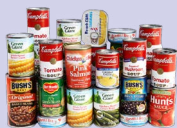
Aluminum & metal cans