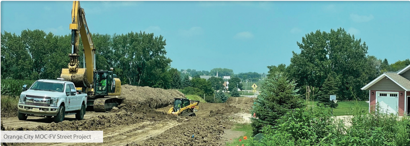
Orange City MOC-FV Street Project