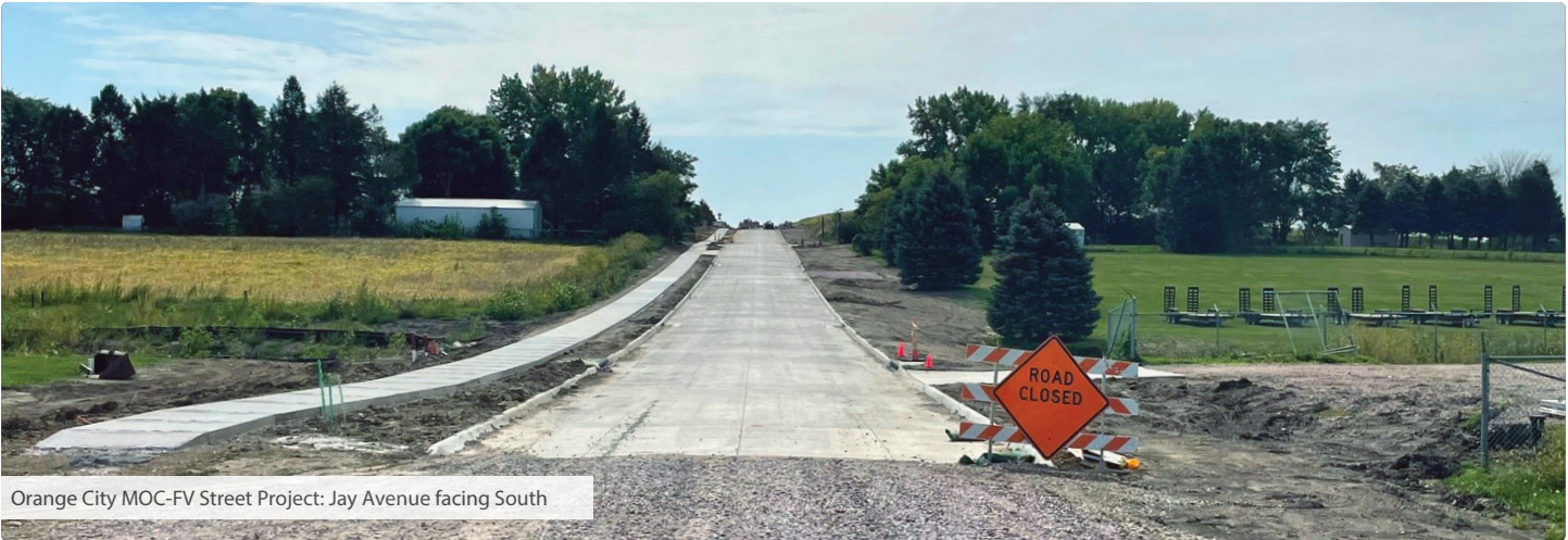
Orange City MOC-FV Street Project: Jay Avenue facing South