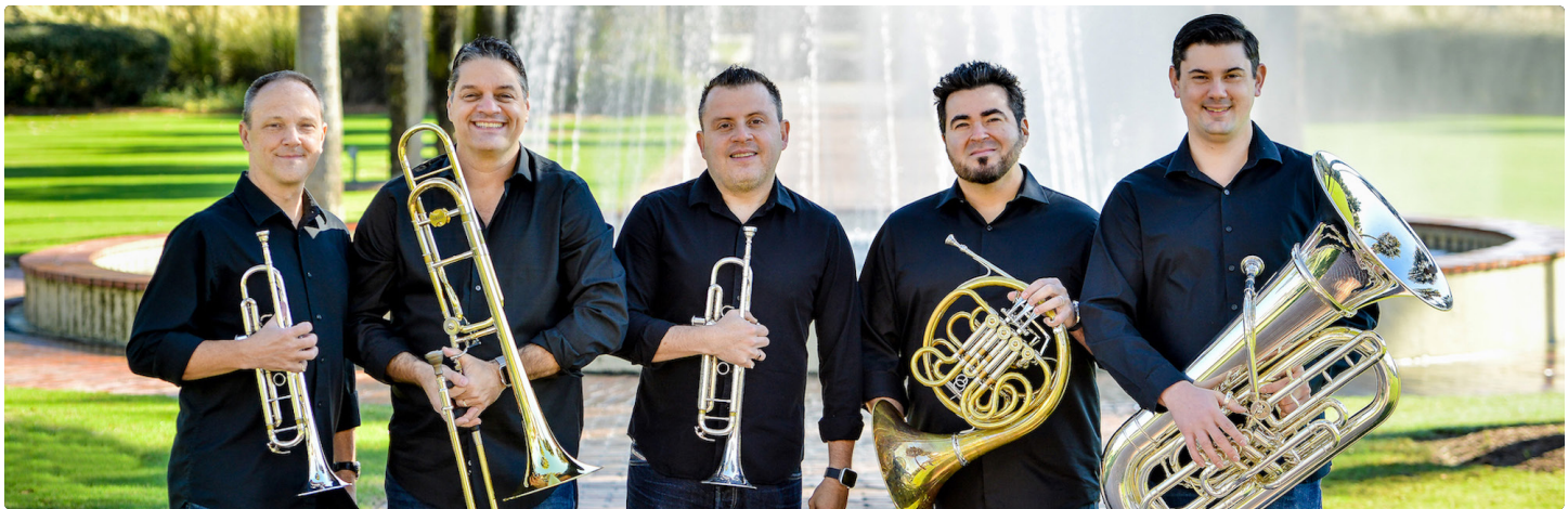
Boston Brass: April 28th